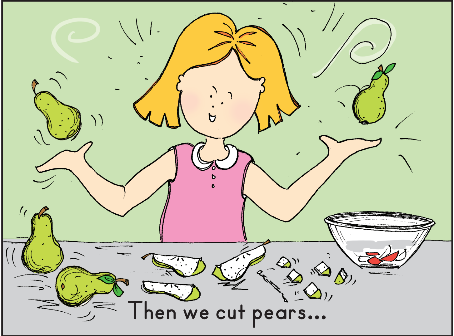
Then we cut pears...