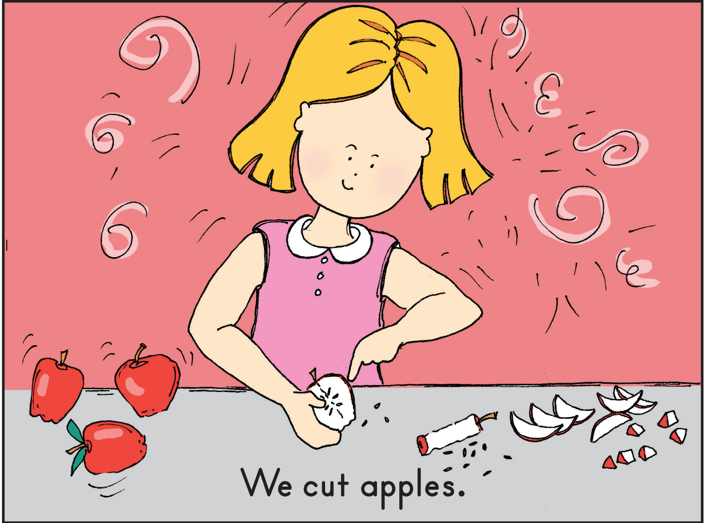
We cut apples.